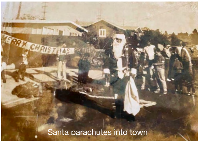
Santa parachutes into town