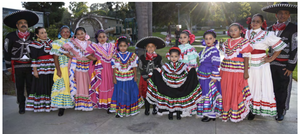
Jalisciense Folklorico Group performers