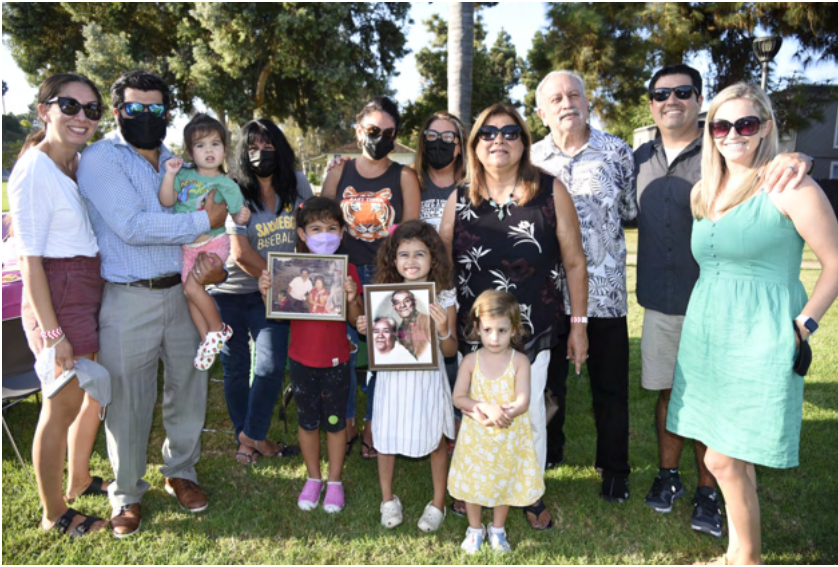
Five generations of Guterrez descendants (

Descendants of many of the first families to settle in La Colonia shared their memories of growing up in the neighborhood and playing along Stevens Creek in what is now La Colonia Park. We taped their testimonials and will soon add them to our website, along with many of the historic family photos residents provided, which were presented in a looping slideshow throughout the evening.